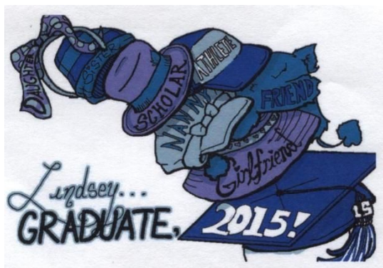
Example (Student's name will appear below the image in the yearbook)

Are you still looking for a professional photographer for your senior portraits? The following photographers have worked extensively with St. Anthony Village High School.